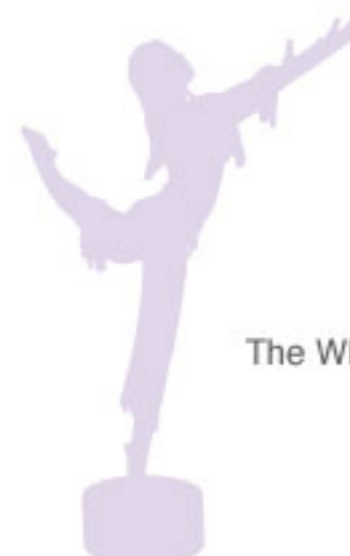
白毛女 The White-Haired Girl