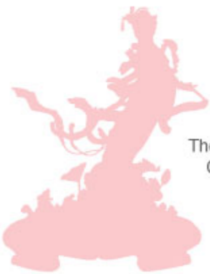
追鱼 The Legend of Carp Fairy