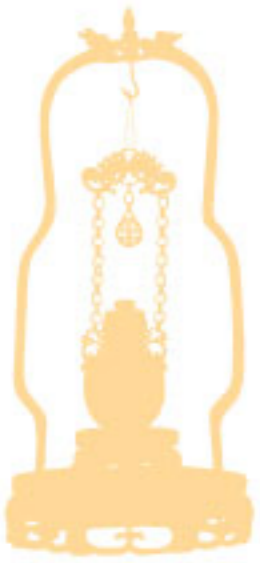
浮雕福寿环链瓶 Jade Flask with Chain Handle and Engraved Chinese Characters of "Fu" (well-being) and "Shou" (longevity)

Please observe the exhibits in the exhibition hall carefully and compare which is the real one. Then please tick [ ] the correct answer in the box.