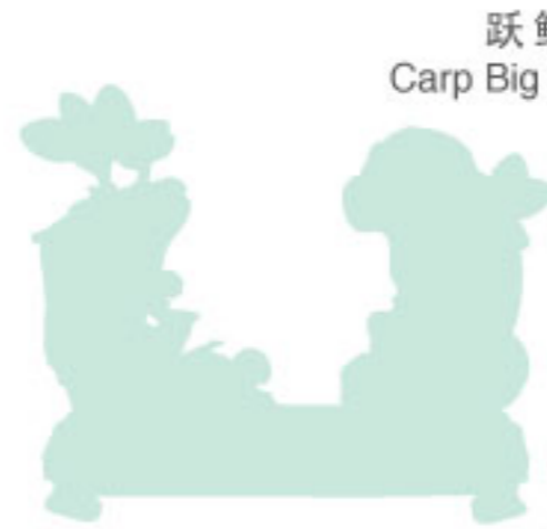
跃鲤 Carp Big Splash